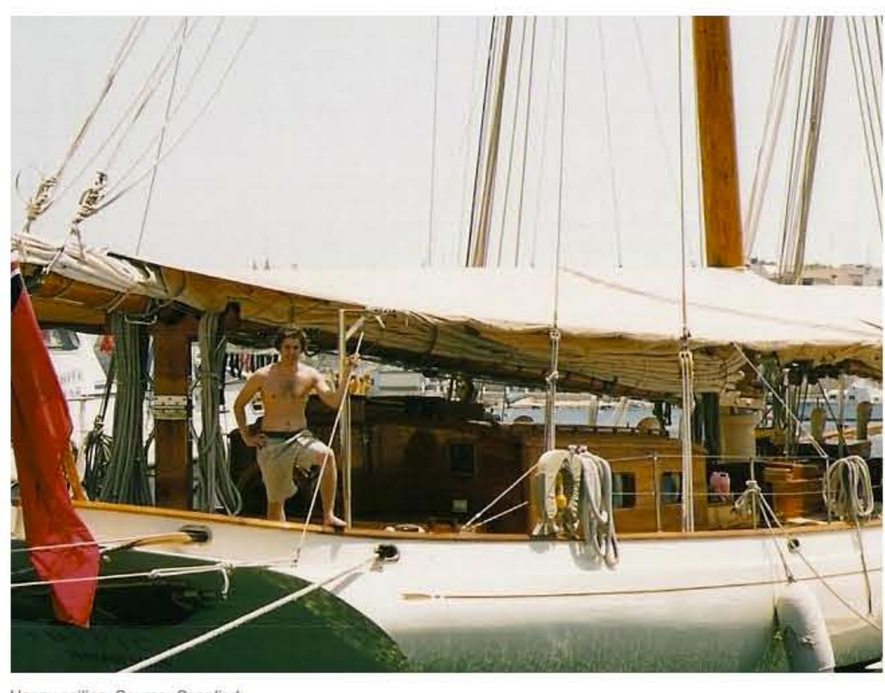
Happy sailing.

BUSINESS: Telstra boss David Thodey steps down FINANCE: Australian dollar lower as Greece talks stall